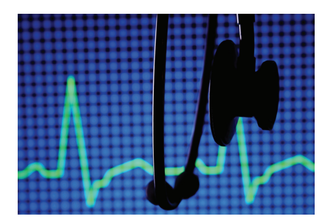
Telemetry Course is a prerequisite to attend!

The goal of the PALS course is to improve the quality of care provided to seriously ill or injured children, resulting in improved outcomes.