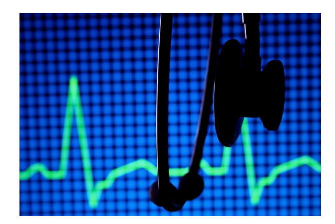
Telemetry Course is a prerequisite to attend!

The goal of the PALS course is to improve the quality of care provided to seriously ill or injured children, resulting in improved outcomes.